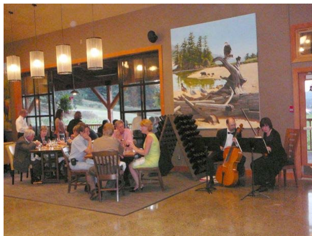
Conference Dinner at Church and State Winery