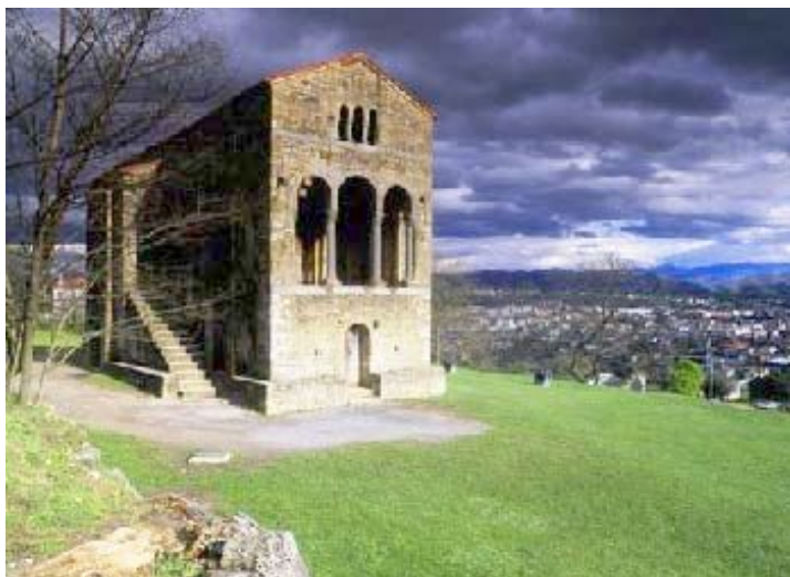
Santa Maria del Naranco (IX Century)