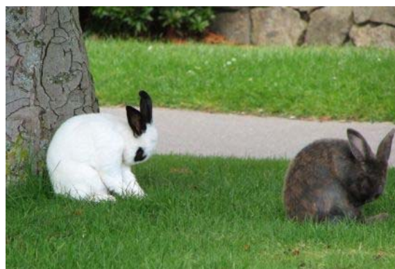
Fluffy bunnies at the University of Victoria campus provided amusement for conference attendees. Often dozens of rabbits were spotted at a time.