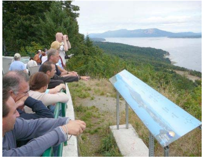
Malahat Lookout, overlooking Saanich Inlet and Salt Spring Island.