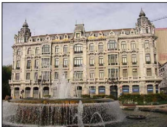
Escandalera Square, Oviedo, Spain

2008: The 25 th Annual TSOP Meeting with ICCP will be in Oviedo, Spain.