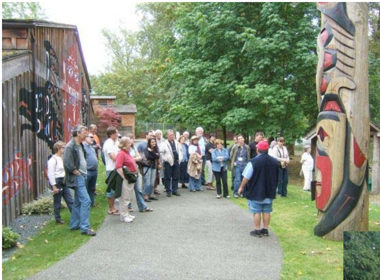
Learning about the First Nations people at the Quw'utsun Cultural Center.