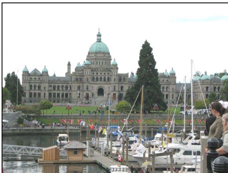
Parliament House, Victoria, BC

The 24 th Annual TSOP Meeting with ICCP and CSCOP.