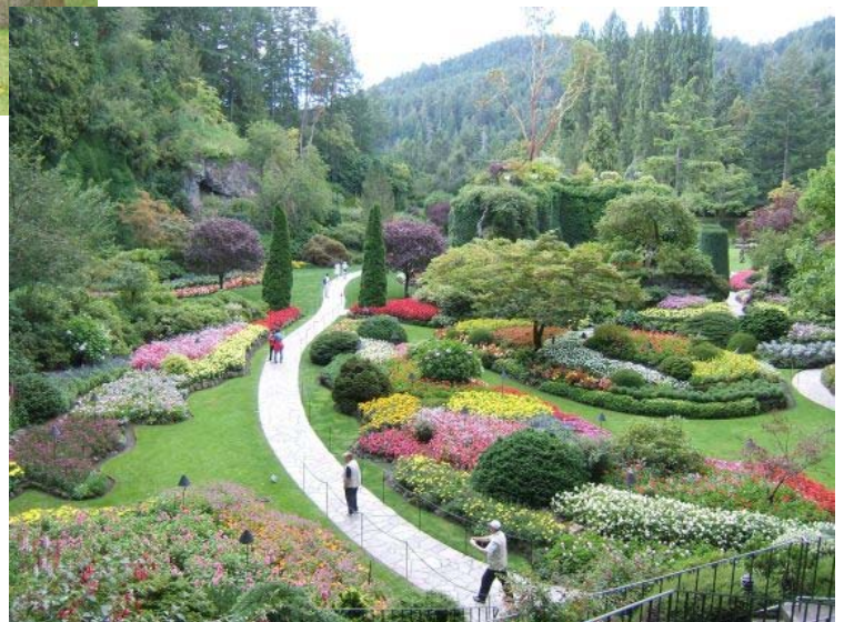
Visiting the lovely Butchart Gardens.