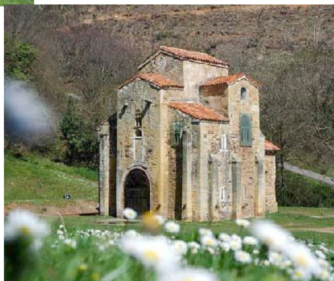
San Miguel de Lillo (IX Century)