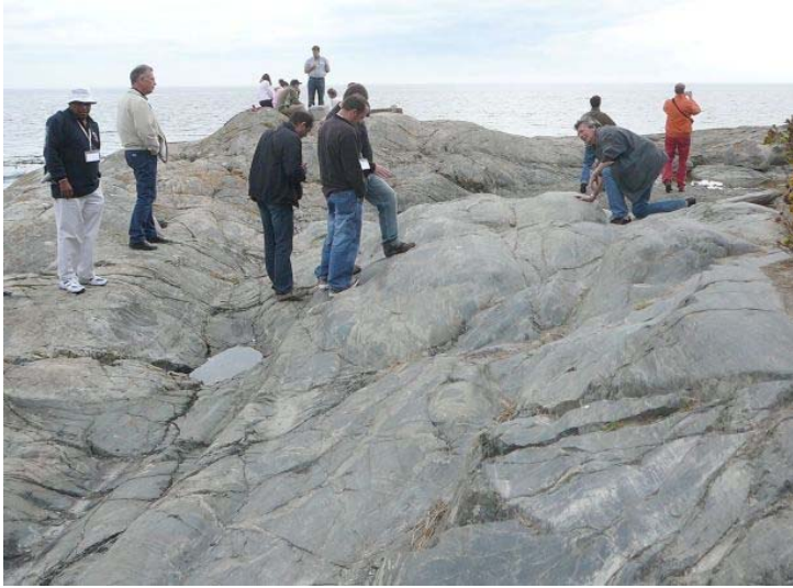
Glacial striations in migmatites at Finlayson Point on the Victorian coast.