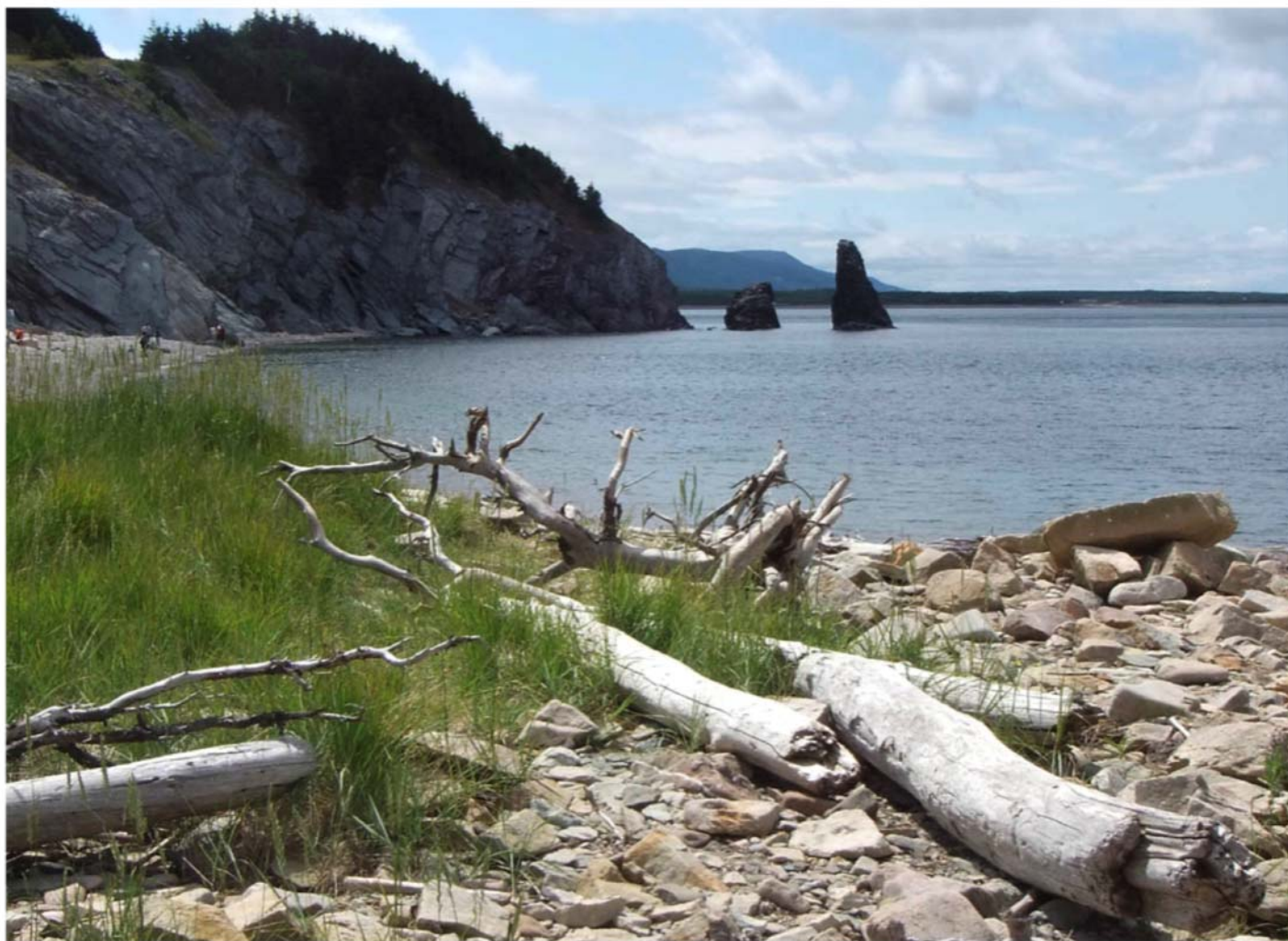
Cape Breton Island, Nova Scotia, Canada